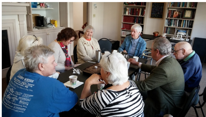
Trinity members enjoy fellowship in the soon-to-be dedicated Reed Chapel following Wednesday Eucharist.