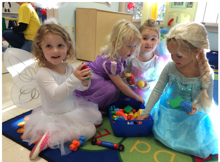
Scenes from our Boo Parade